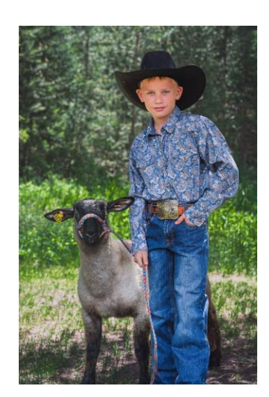
Missoula County Extension 4-H www.missoulaeduplace.org/4-h

Montana State University Extension is an ADA/EO/AA Veteran's Preference Employer and provider of educational outreach.